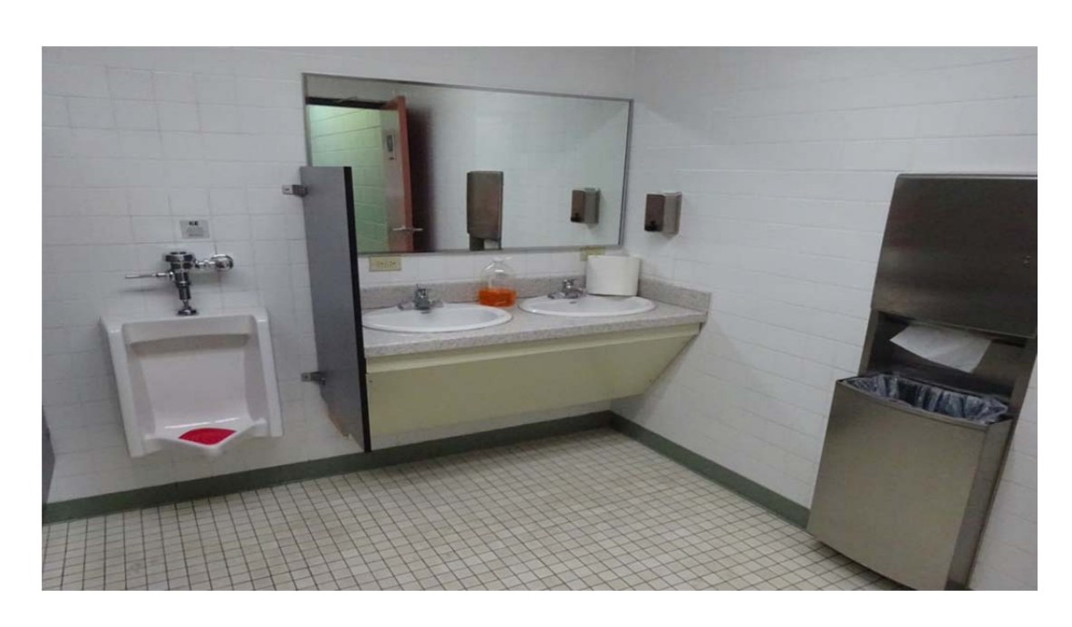
Renovation of all Men's and Women's Toilet