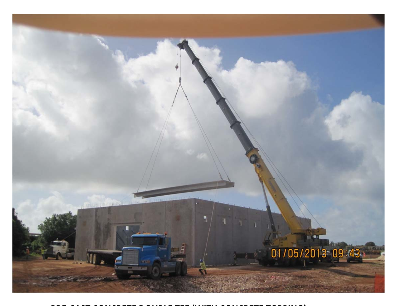
PRE-CAST CONCRETE DOUBLE TEE (WITH CONCRETE TOPPING)