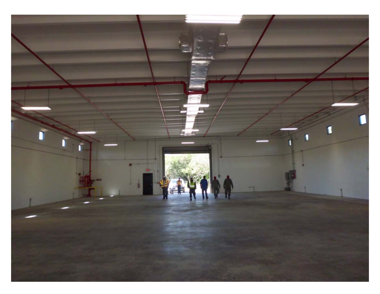
INTERIOR OF DISASTER RELIEF BEDDOWN SYSTEMS STORAGE FACILITY