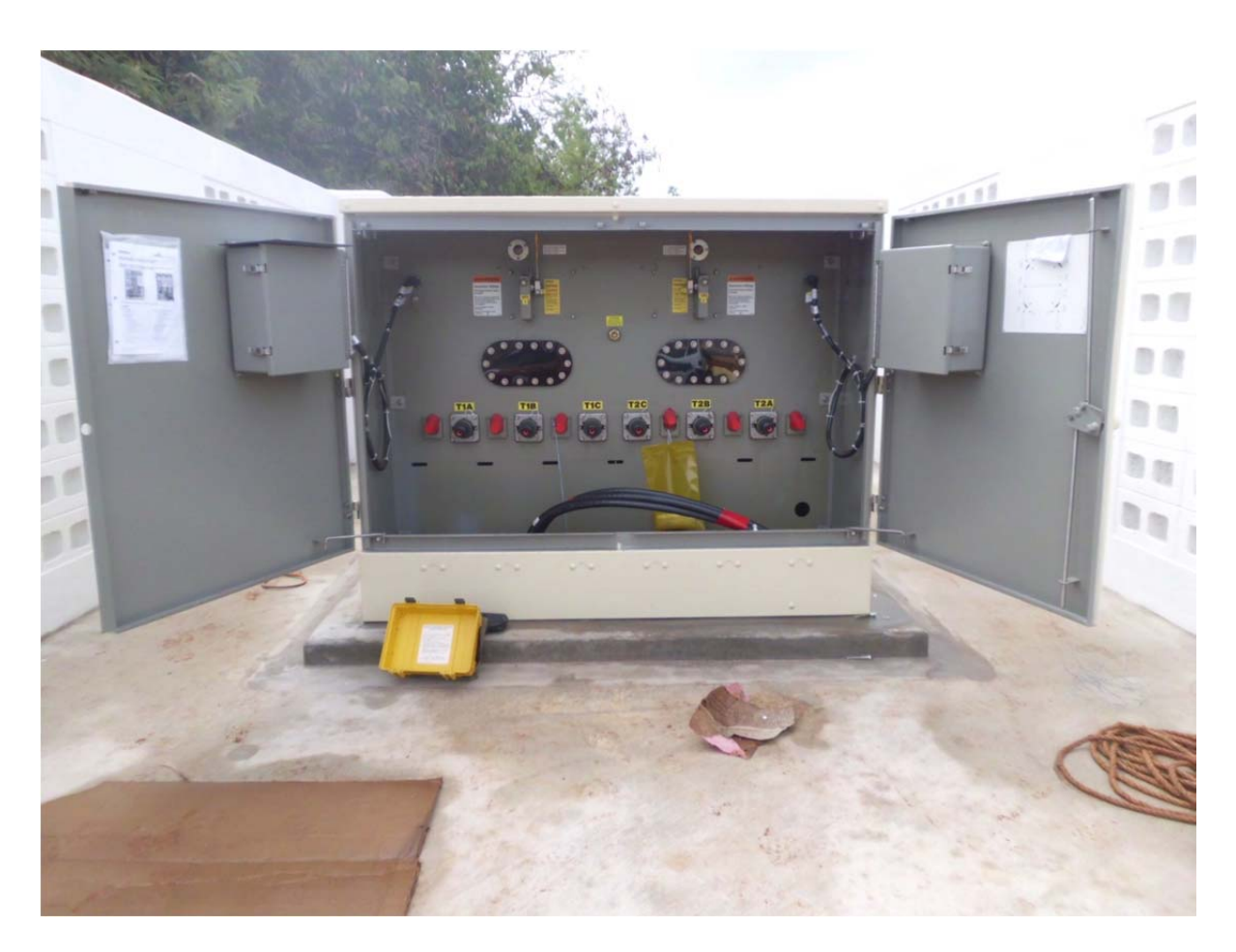
4-WAY PAD-MOUNTED SWITCHGEAR