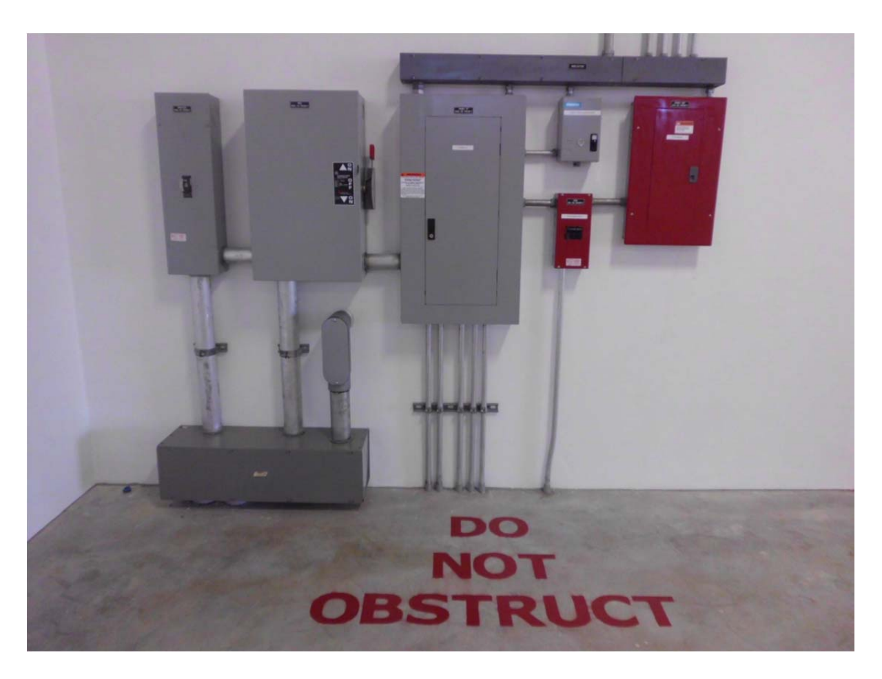
ELECTRICAL PANEL BOARDS