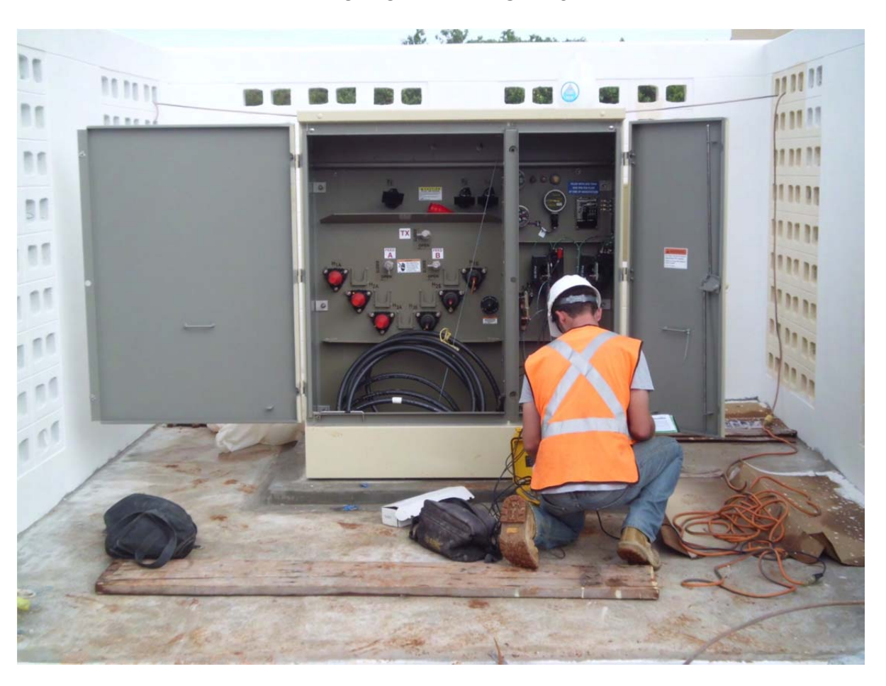
75 KVA PAD-MOUNTED TRANSFORMER